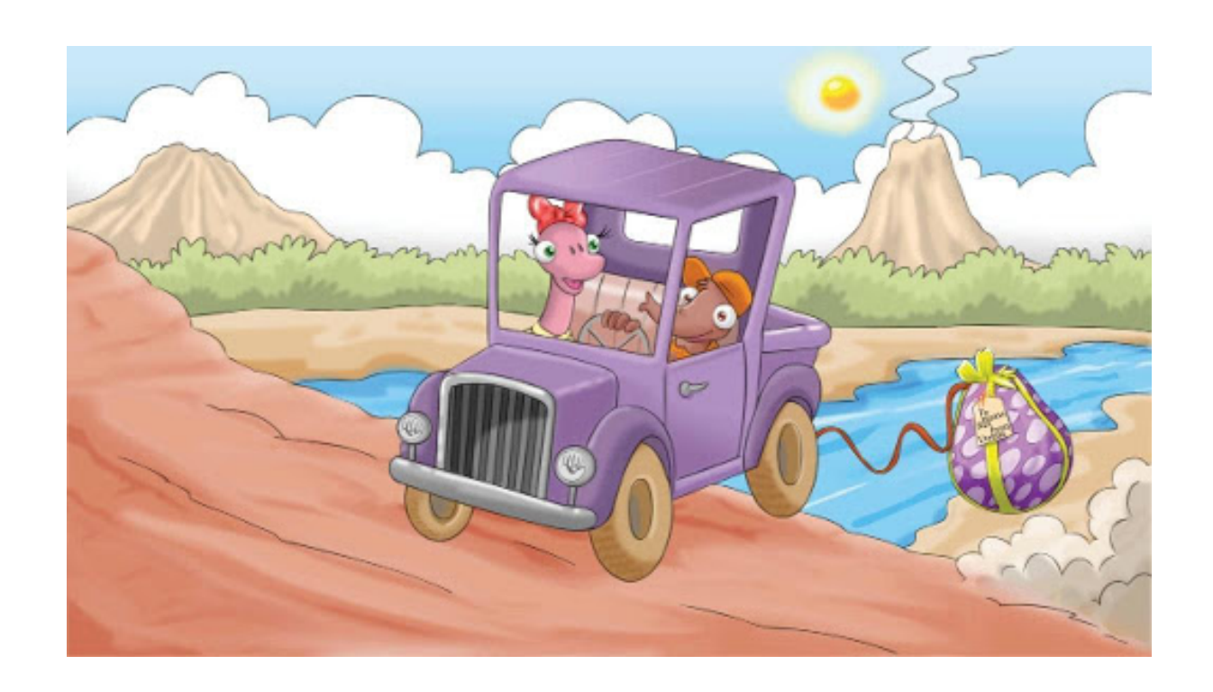
Mr. Pepper drove the truck and the truck pulled the gift behind. They began to climb the hill. But suddenly . . .