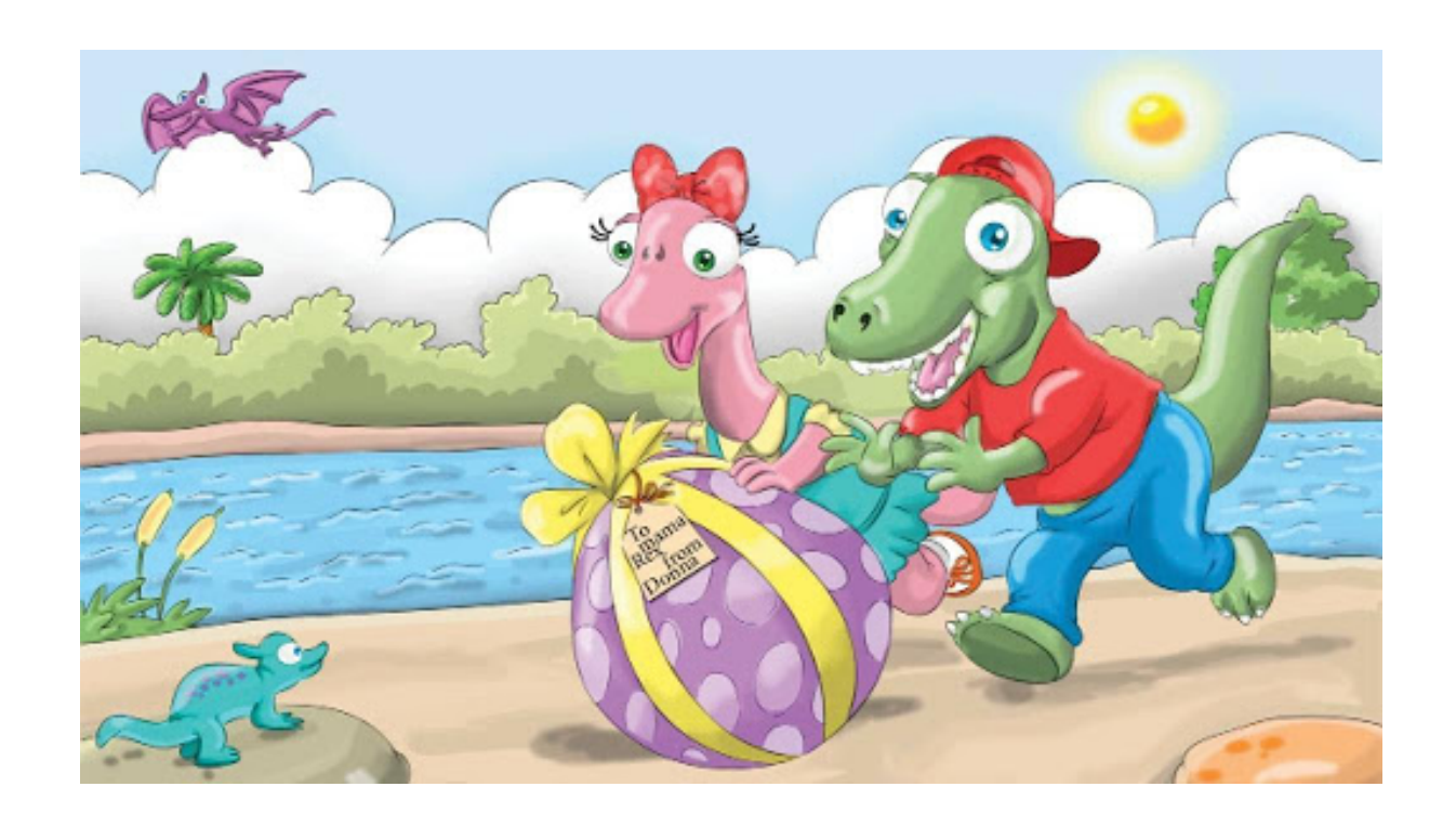
The gift finally moved! The friends yelled, "Hip hip hooray!"